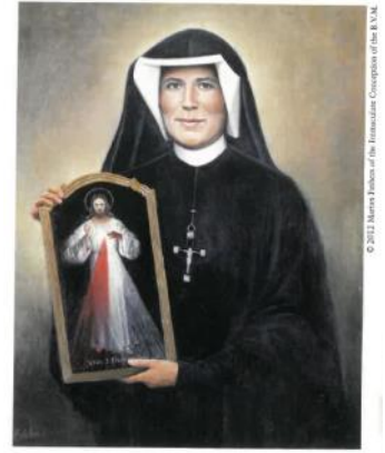
St. Maria Faustina Kowalska (1905-1938), who Pope John Paul II called the Secretary and Apostle of Divine Mercy, provides through her writings the impetus to the modern Divine Mercy message and devotion. Her witness reminds our hurting modern world of the heart of Sacred Scripture: the good news of God's mercy for sinners.

St. John Paul II explained it best. First, he pointed out something we all know: namely, that there are all kinds of blessings in our contemporary society. For instance, modern technology has done so much to make life easier for us. Just think of e-mail, cell phones, smartphones, and air-conditioning. All these things are blessings. Yet, in the midst of these blessings and in some ways because of the very same advances in technology that brought them, John Paul would say that evil has a reach and power in our day like never before . Indeed, our time, sadly, is marked by unprecedented evil. Despite this, John Paul would also say, "Be not afraid." Why should we not be afraid? Because of what St. Paul writes in Romans, "Where sin increased, grace abounded all the more" (5:20). In other words, God is not outdone by evil. So, in a time of great evil, God wants to give even greater graces, and in our time, the graces are huge , precisely because there's so much sin. Basically, then, what I want to share in the remainder of this introduction to Divine Mercy, this Divine Mercy explained , is how we can tap into the extraordinary graces of our time. Which makes sense, right? I mean, if there are tons of graces available to us, why not gather them in?